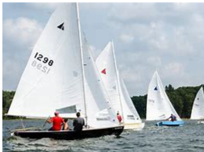
18-foot Interlake, with trailer, $1,000

Footloose is raising operating funds by selling the following equipment. Please contact us if you are interested.