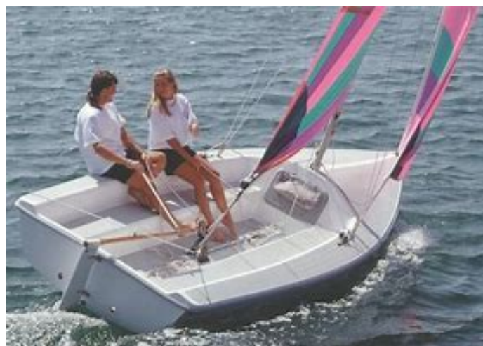
Catalina 16.5, with trailer, $1,200